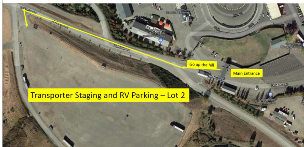
Transporter Staging and RV Parking -- Parking Lot 2

You should be in the staging area before 05:00 pm on Thursday to ensure we can get every team into the Paddock before it gets dark.